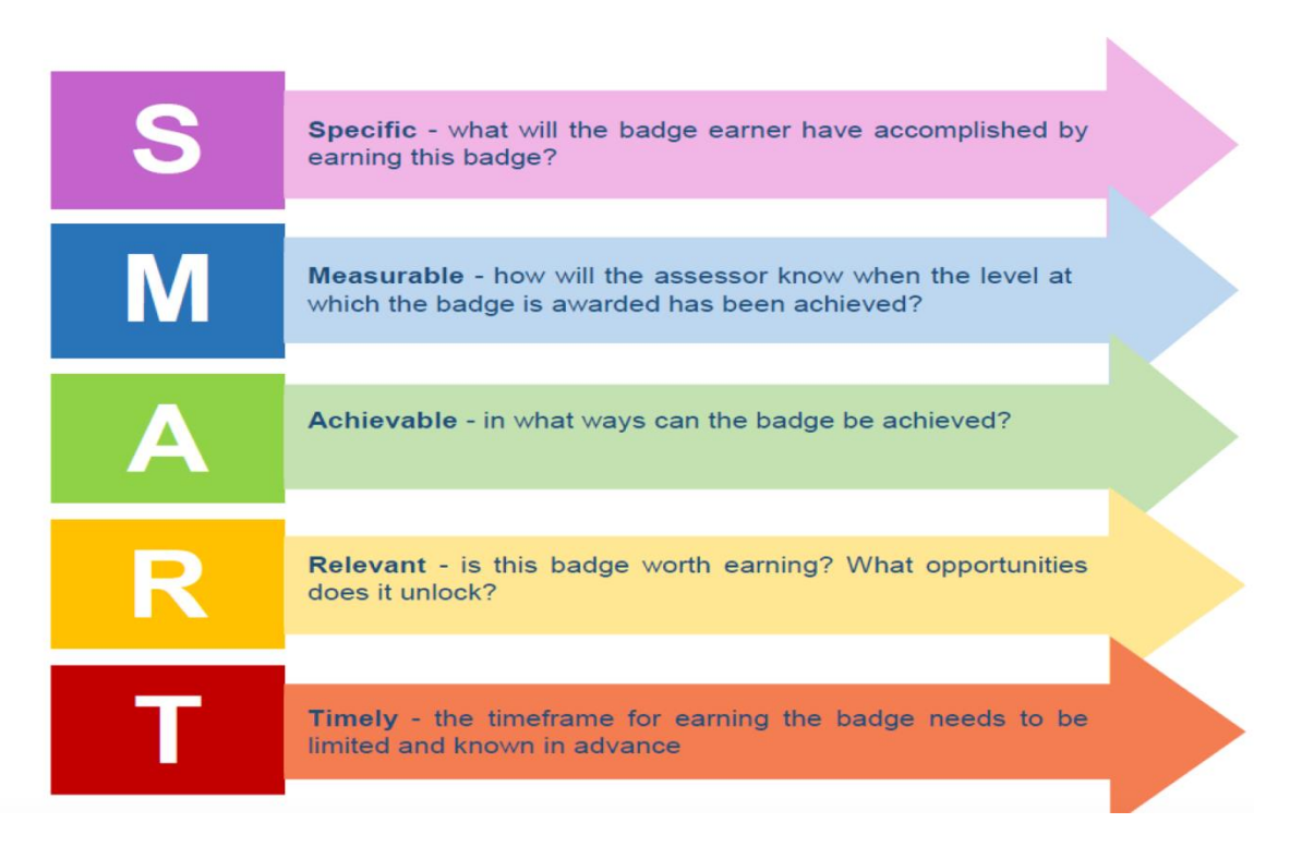
Picture 2. The SMART method according the Guide for educators "Open badges for adult education" (2016).

Earning criteria must indicate what a learner has to do in order to earn the badge. According to the Guide for educators "Open badges for adult education" (2016), a useful approach to write badge criteria is the "SMART" method. Such method points out five relevant questions that we have to take into account when constructing earning criteria. These questions address helpful fundamental principles, i.e.: specificity, measurability, achievability, relevancy, and time (Picture 2).