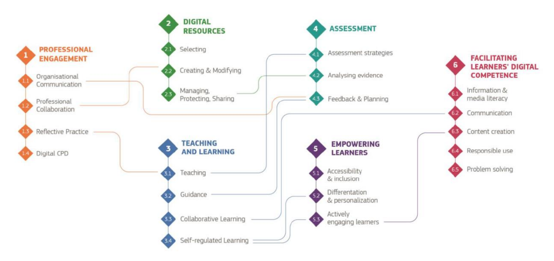
Picture 1. Overview of the DigCompEdu framework: areas and competences<sup>5</sup>

The framework also identifies six proficiency levels: